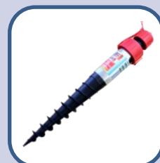
Ground Screw 60 cm