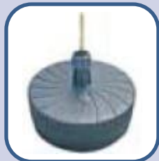
Water / Sand Filled 30/50kg