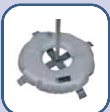
Water Filled Tube 7kg