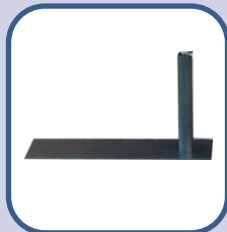
Car Base Plate