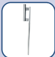
Standard Steel Pin 40 cm