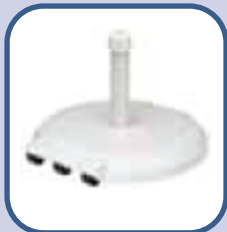
Concrete Stand 38kg