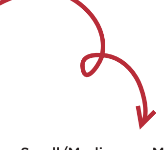
Small/Medium 18cm Loop