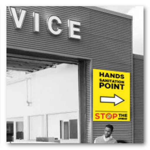
CORREX SIGNAGE - NF06