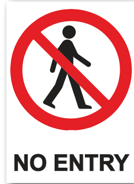
CORREX SIGNAGE - NF13