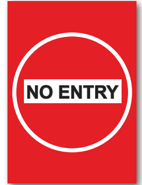
CORREX SIGNAGE - NF10