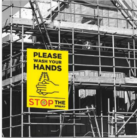
CORREX SIGNAGE - NF02