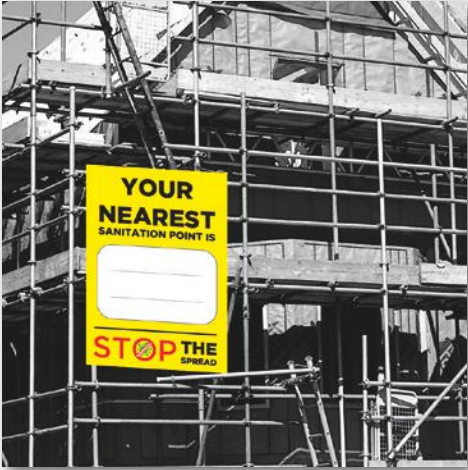
CORREX SIGNAGE - NF01