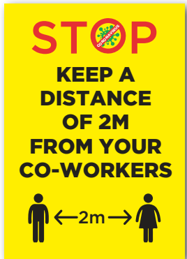
CORREX SIGNAGE - NF15