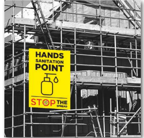
CORREX SIGNAGE - NF03