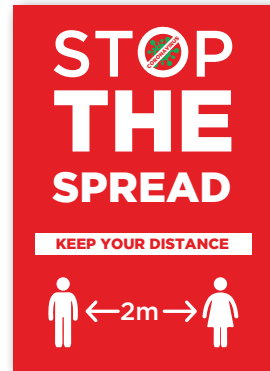
CORREX SIGNAGE - NF17