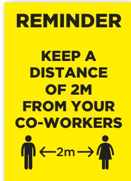
CORREX SIGNAGE - NF16