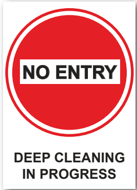
CORREX SIGNAGE - NF11