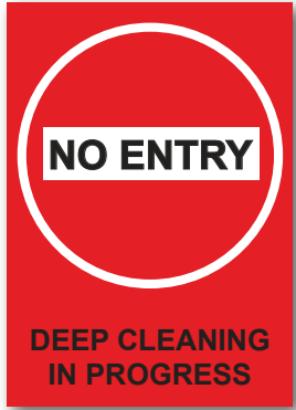
CORREX SIGNAGE - NF07