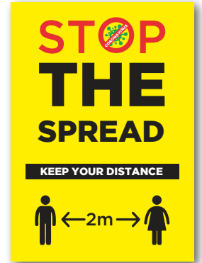
CORREX SIGNAGE - NF14