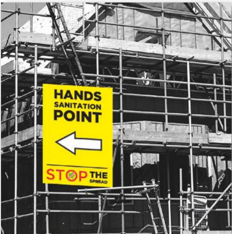
CORREX SIGNAGE - NF04