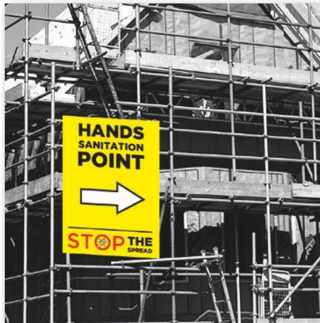
CORREX SIGNAGE - NF05