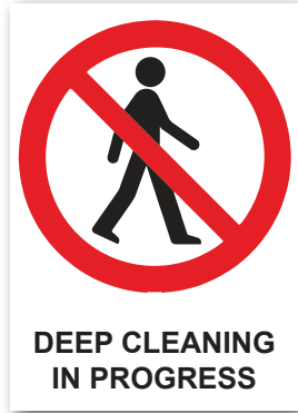
CORREX SIGNAGE - NF12