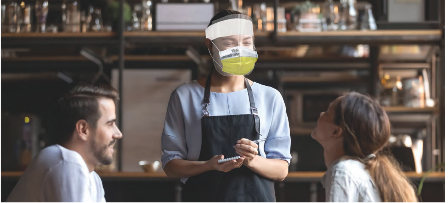
CORPORATE FACE MASKS